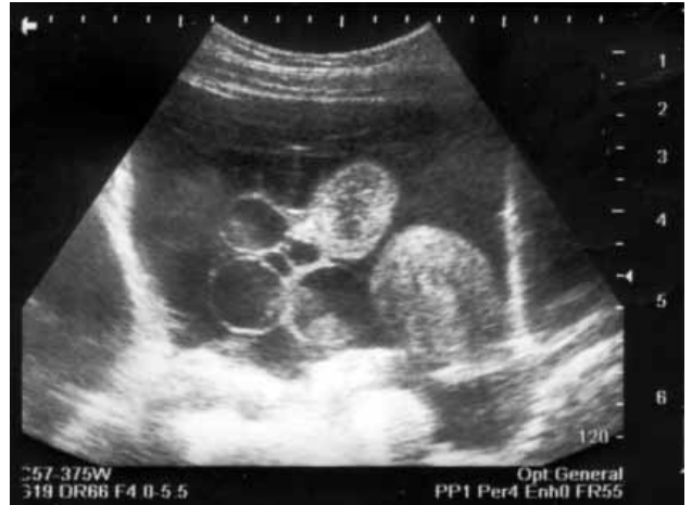
Fig. 2. Tumoral mass exhibiting cystic features.