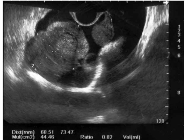
Fig. 1. A transvaginal ultrasonogram demonstrating a multi-locular tumor, measuring 7x6 cm in diameter, with dominant solid components and irregular margins.