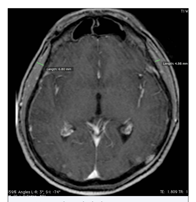
Fig. 1. Temporal muscle thickness measurement on a 52 years- old-male patient with non-small cell lung cancer. Contrast-enhanced axial T1 weighted MR image shows temporal muscle thickness measurement bilaterally.

The patients' characteristics are shown in Table 1. Overall, 94 patients were available for further analysis,