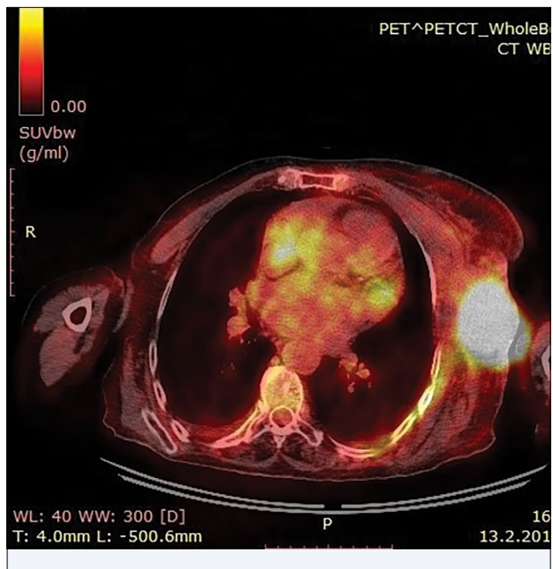
Fig. 3. PET image shows high uptake in the left axilla (SUV_{max}: 16.69) .

cytokeratin (CK)-7 and negativity for CK-20. These features resembled the original breast carcinoma. Thus, the tumor was not consistent with metastasis of the adenocarcinoma of the rectum.