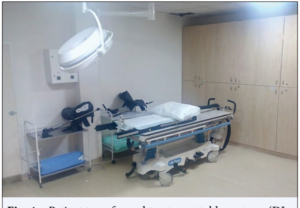
Fig. 4. Patient transfer and treatment table systems (DI-ACOR Zephry HDR) in the brachytherapy application room.

ning information data are taken through a printer for reporting and control. All stages of the treatment plan approved here are checked with print data. This set of data is a summary of the accepted treatment plan and shows all stages. Print data contain the following parts: Patient Information, Treatment Unit, Calibration Data, Treatment Data, Dose Normalization, Optimization and Prescription, Source Positions, Catheter (channel) Times, Total Treatment Time, Source Coordinates and Times, Applicator Points. Our patient plan sent to the treatment device is uploaded to the system and checked with print data. Here, the patient information and all the catheters of multichannel that are actively filled during the planning are checked. For the fraction, dose and total treatment time are checked by comparing the print data and the pre-treatment report. After the CT scan, the patient is transferred to the treatment device for treating, and then the cylinder orientation is checked after the applicator's catheters are connected to the treatment device. After print data and the treatment device have been checked, patient treatment is initiated, and the patient treatment is completed while the patient is followed up with camera systems.